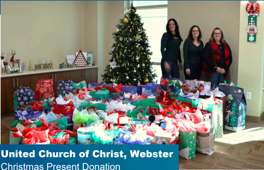
United Church of Christ, Webster Christmas Present Donation