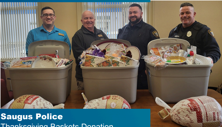
Saugus Police Thanksgiving Baskets Donation