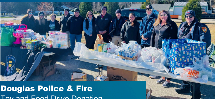
Douglas Police & Fire Toy and Food Drive Donation

Over $185 thousand in sponsorships, community events, and business development.